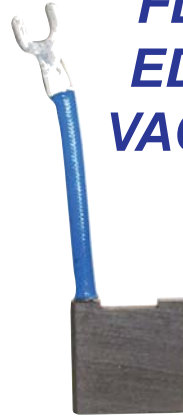
Part # 243 fits Clarke Super 7R Edgers 3/16 x 29/32 x 1 $3.71