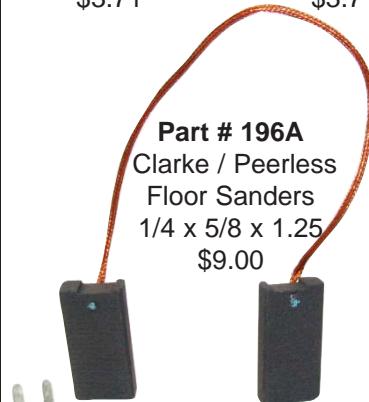
Part # 196A Clarke / Peerless Floor Sanders 1/4 x 5/8 x 1.25 $9.00