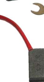
Part # 103605 "Ohio" 115 volt 5/16 x 1/2 x 7/8 $6.75