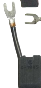
Part # 36-378121 "Imperial" 36 & 48 volt 3/8 x 13/16 x 1.2 $7.88