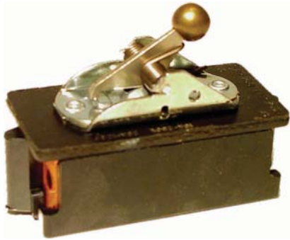
202645 SPDT OFF - MOM. ON 20 amp. 125 volt