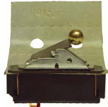
8909K204 DPST OFF - MOM. ON 16 amp. 125 volt