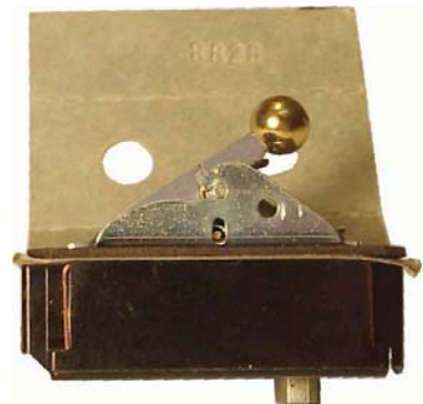
8909K209 DPST OFF - MOM. ON 16 amp. 125 volt

EURTON ELECTRIC CO., INC. 9920 PAINTER AVE., P.O. BOX 2113 SANTA FE SPRINGS CA 90670