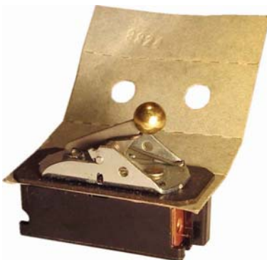
8905K178 DPST OFF - MOM. ON 16 amp. 125 volt