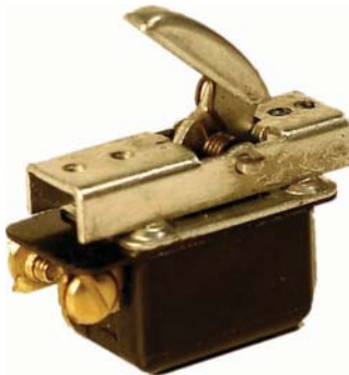
8300K4 SPST OFF - MOM. ON 6 amp. 125 volt