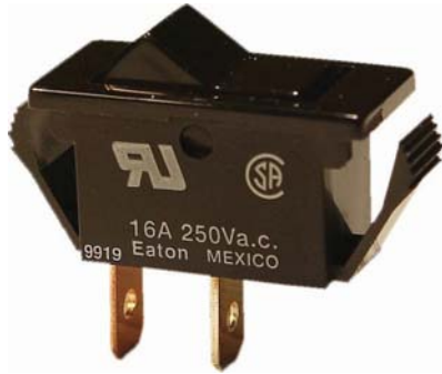
1600-11E SPST ON - OFF 16 amp. 250 volt