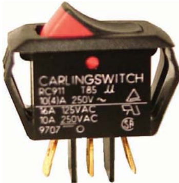
1604-11E SPDT ON - OFF - ON 16 amp. 125 volt