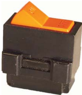
8326K2 SPST ON - OFF 6 amp. 125 volt