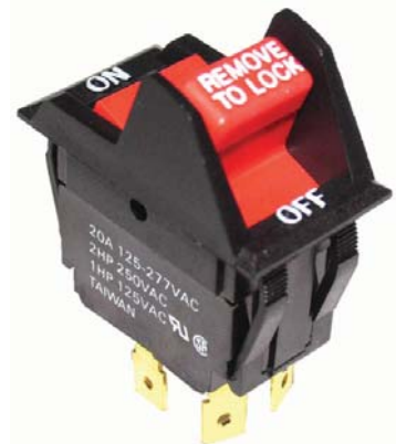
8166K21 DPDT ON - OFF 20 amp. 125 volt

EURTON ELECTRIC CO., INC. 9920 PAINTER AVE., P.O. BOX 2113 SANTA FE SPRINGS CA 90670