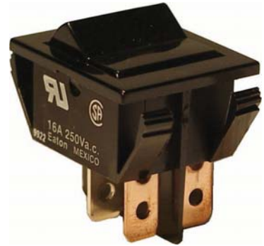
2600-11E DPST ON - OFF 16 amp. 250 volt